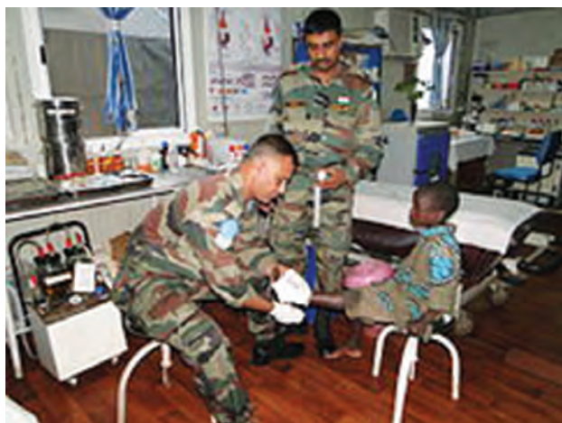
Indian Peacekeeping Forces

United Nations Peacekeeping : The peacekeeping activity of the United Nations involves creating appropriate circumstances favourable for bringing about permanent peace in strife-torn areas. The peacekeeping forces help these areas to progress towards peace. In conflict-ridden areas, security is provided and at the same time, help is extended for