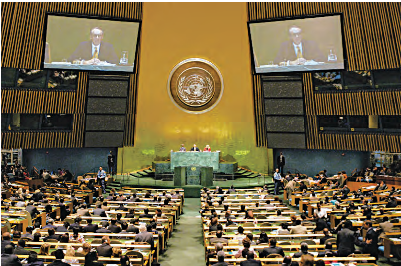
United Nations-General Assembly